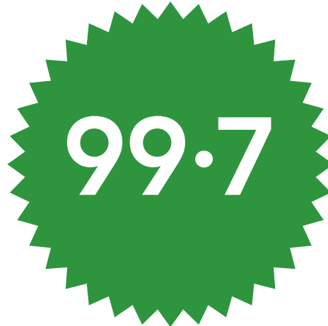
Top ATAR 99.7 (2 students) 5 students with ATARs 99+