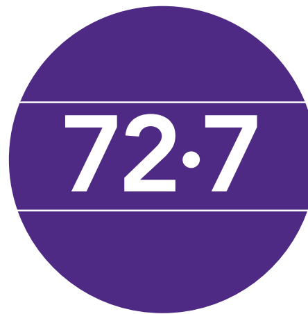
Median ATAR 72.7