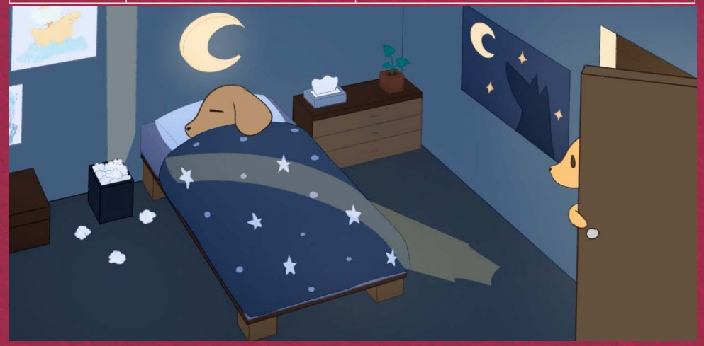
Kira - Noodog