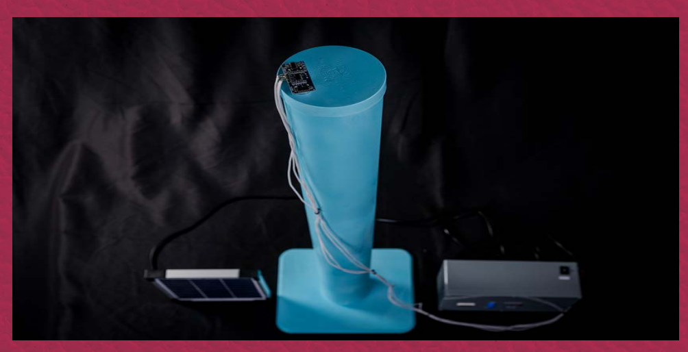
Alistair - Off-Grid Digital Water Tank Meter