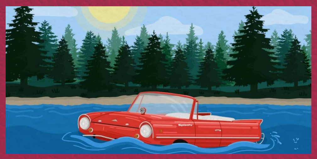
Faith - Amphicar770